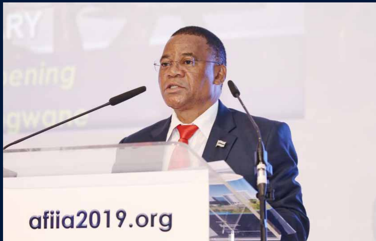
Vice President of the Republic of Botswana, Mr Slumber Tsogwane giving opening remarks during AFIIA 2019