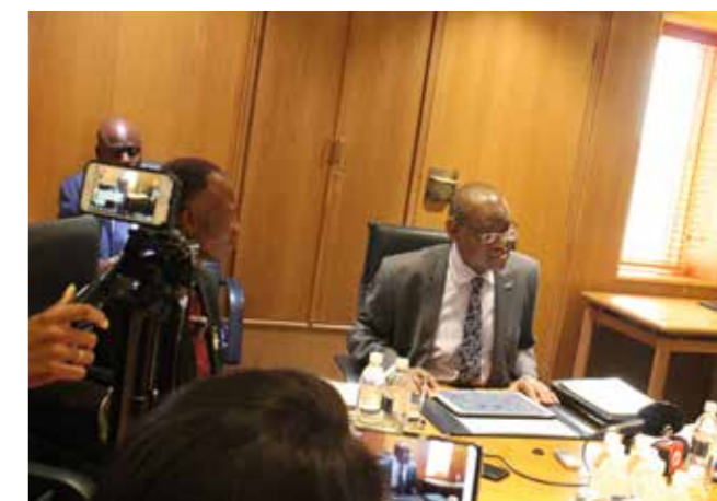
The Governor, Mr Moses Pelaelo briefing the media during the Monetary Policy Committee (MPC) Media Briefing, where the MPC decided to maintain the bank rate at 4.75 percent

In accordance with policy and established practice, the Governor briefed media on the decision by the Monetary Policy Committee (MPC) of the Bank to cut the Bank rate. The MPC of the Bank had decided to reduce the Bank Rate by 25 basis points from 5 percent to 4.75 percent. The Governor, Moses Pelaelo, stated that inflation increased from 2.8 percent in June 2019 to 2.9 percent in July, and was below but closer to the lower bound of the Bank's objective range of 3 – 6 percent. Nonetheless, inflation is forecast to revert within the Bank's 3 – 6 percent objective range in the first quarter of 2020.