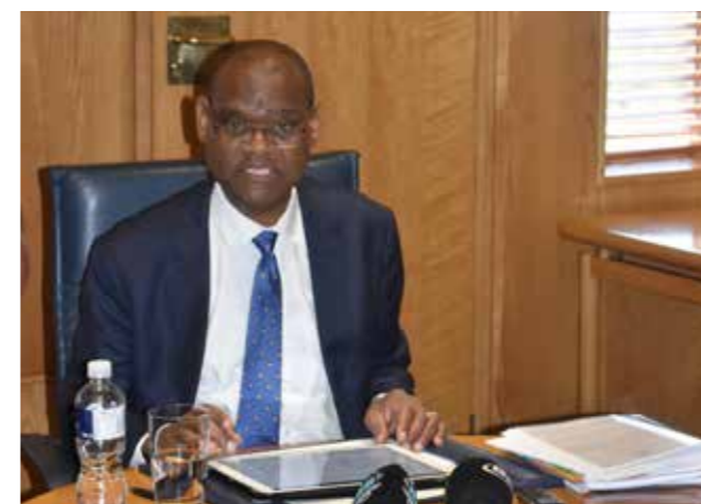
The Governor, Mr Pelaelo briefing the media during the MPC media briefing that was held on October 31, 2019, at the Bank of Botswana.