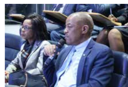
Government Officials during the Bank's Economic Briefing to Government Officials